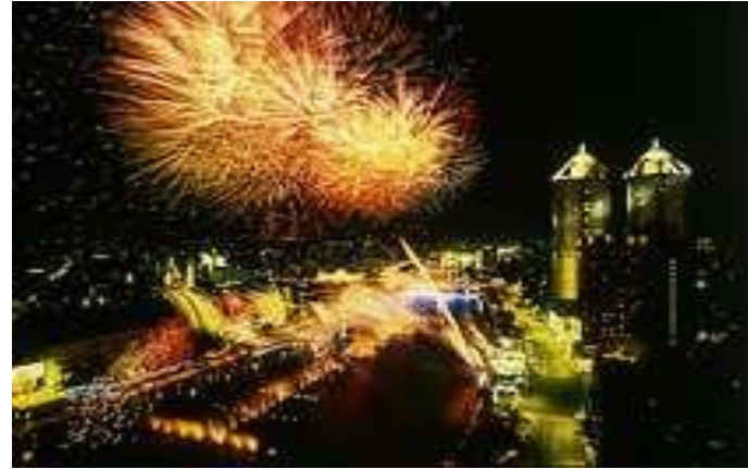
Taipei & Kaohsiung Lantern Festival